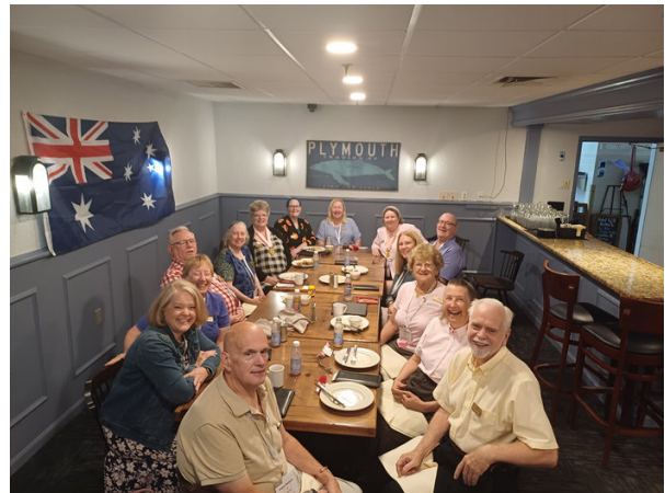
We were delighted so many charter and dual members were able to attend our Breakfast meeting on the Sunday morning.