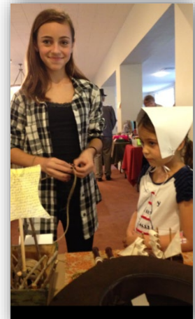
Houston Colony Juniors demonstrating coif-making at 2014 Pilgrim Festival